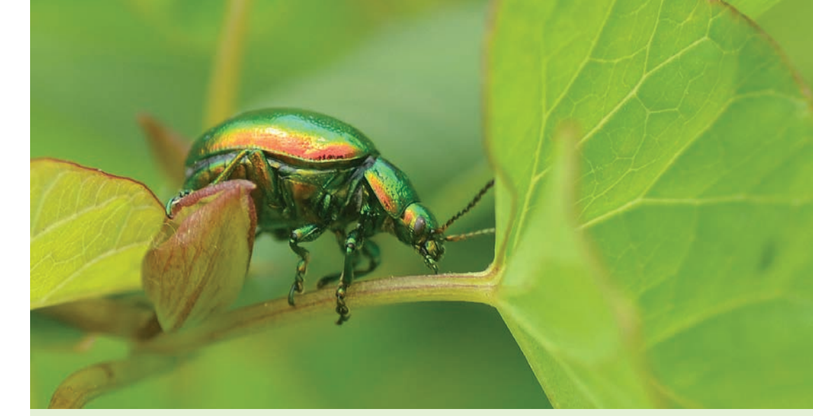
The very rare tansy beetle ( Chrysolina graminis ), a beautiful iridescent species.

This page: Surveying for aquatic plants.