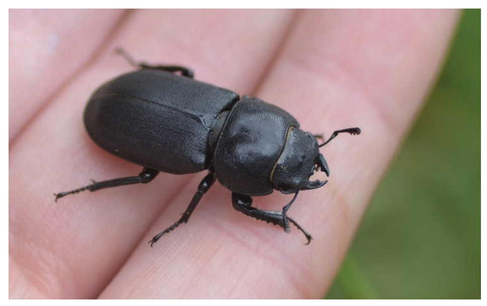
Lesser stag beetle, Dorcus parallelipipedus

Biological records are essential for species conservation. Fundamentally, we cannot conserve species if we do not know where they are. Biological records allow us to manage nature reserves with both species and habitats in mind, and know when we are getting practical conservation measures correct! At a local level, biological records can be used to map where species are found within a county, and assess which species are locally more common or rare. This means we can prioritise conservation measures accordingly. Councils and ecological consultants also use them to ensure that biodiversity is taken into account in the planning process. Nationally, biological records can be used to produce national atlases showing where species are found and assess trends in populations. To date, over 120 atlases have been produced using more than 150million biological records! Biological records also allow us to predict the effect that changing conditions such as climate change may have on species and habitats and how our conservation measures can take this into consideration.