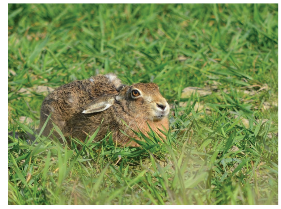
Brown hare (Lepus europaeus)