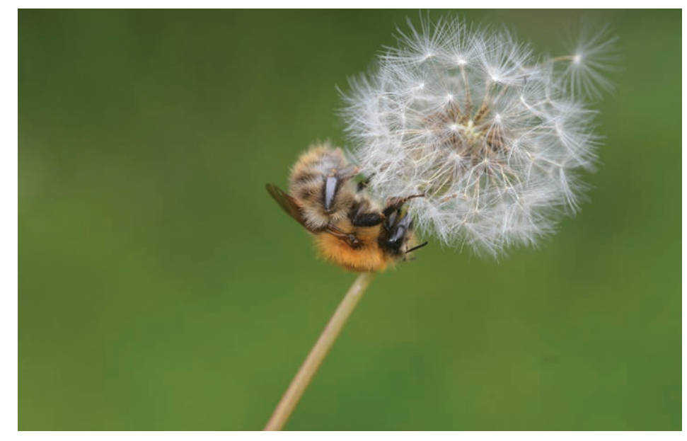
Common carder (Bombus pascuorum)

CPERC holds species, habitat and designated site information for the area. We welcome reliable records from both members of the public and experienced recorders and have validation and verification procedures to help ensure accuracy of the data. We also share records with organisations and individual recorders with the aim of having the most complete datasets available. We currently have over 2 million species records in our database and this is being added to regularly over time.