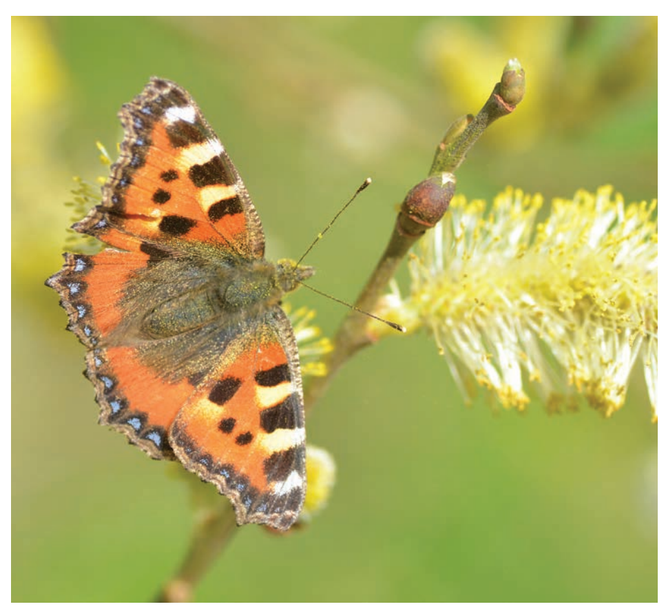
Small tortoiseshell (Aglais urticae)

For a wide variety of taxonomic groups there are national schemes and societies which oversee record collection of that group. Their experts can help ensure that data is correct, and are often involved in producing checklists and atlases and help with the identification of their species group.