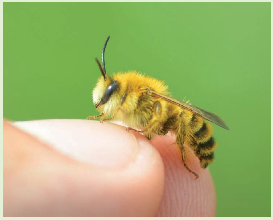
Dasypoda hirtipes, the pantaloon bee

The Wildlife Trust for Bedfordshire, Cambridgeshire and Northamptonshire hosts three individual records centres, covering each of these counties, who work to collect and collate this information to make it accessible to those that need it. This guide will introduce you to your local records centre and how you can get involved with sending in records.