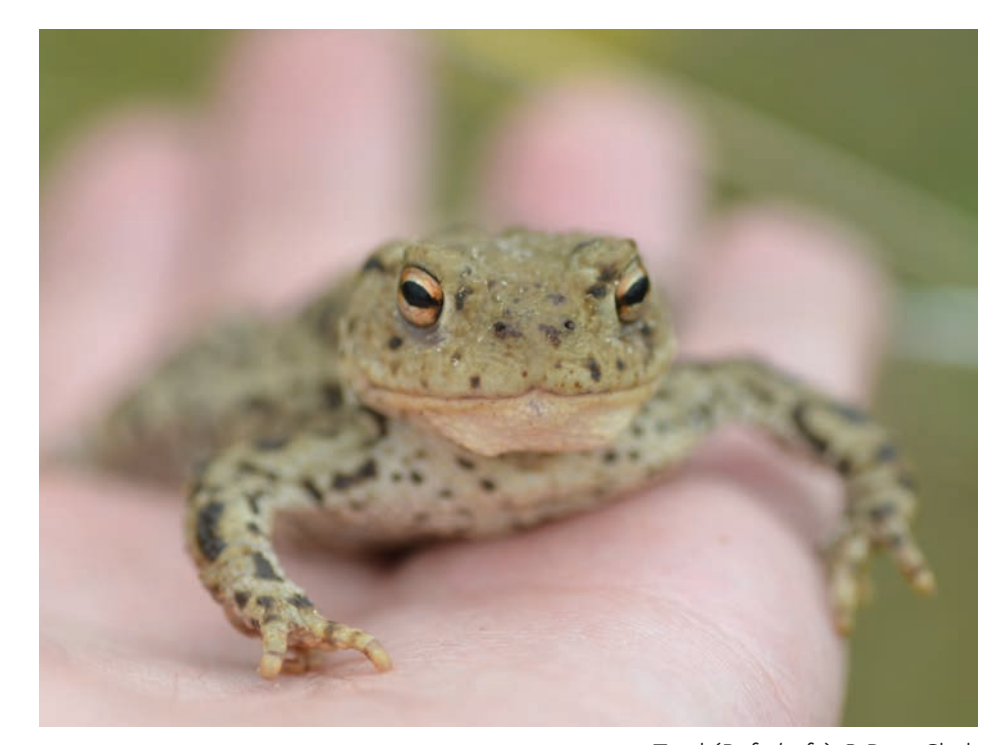
Toad (Bufo bufo)