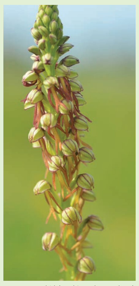
Man orchid ( Orchis anthropophora )

There are three local environmental records centres that cover the counties of Bedfordshire, Cambridgeshire and Northamptonshire, all hosted by the Wildlife Trust BCN. All are members of the Association of Local Environmental Record Centres (ALERC) whose members run a network of data centres covering the whole of the UK, each operating at a local level.